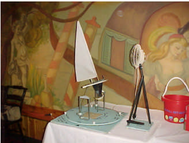
Figure 4. Tom Gallagher is known for developing many training aids. This is his sailboat demonstrator.