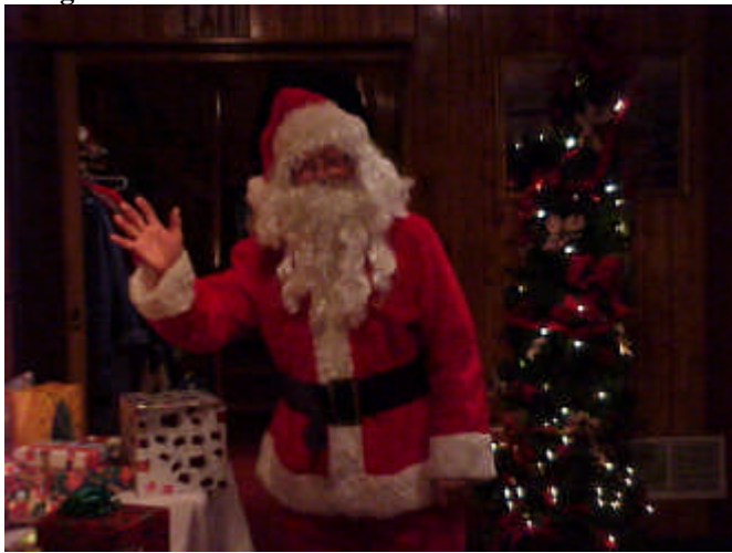
Figure 10. Santa Was Busy Giving Out All The Presents.