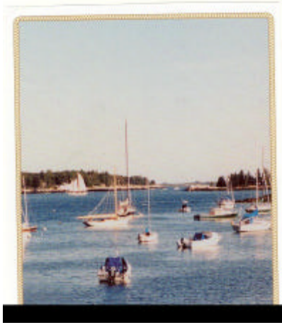
Figure 1. Before anchoring, what is the most important consideration?