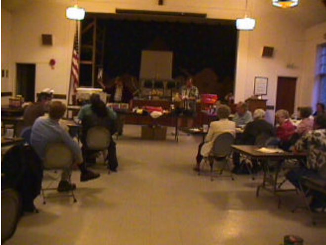
Figure 4, The Auction Hall

This an extra page of photos that is only going out to email receivers. Enjoy. MHPS Auction photos