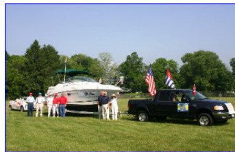
Rhinebeck Parade "Action Photos"