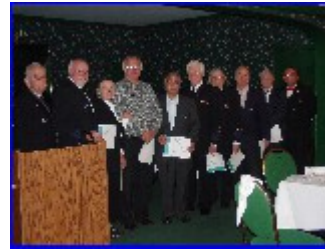
More Well Deserving Award Winners