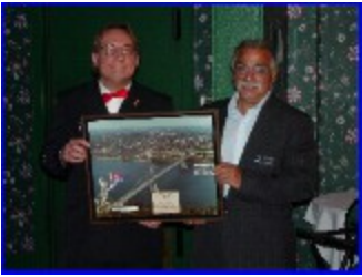
Quite a Surprise: E. Dean Wilcox Award for 2007