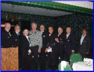
Well Deserving Award Winners