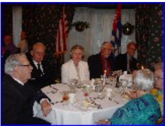
The” Godfather” in Conference.