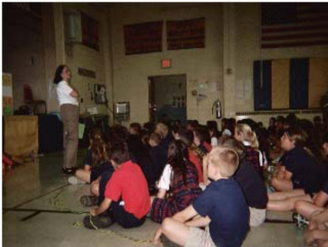
Kid's Class at Bishop Dunn Memorial School June 12th