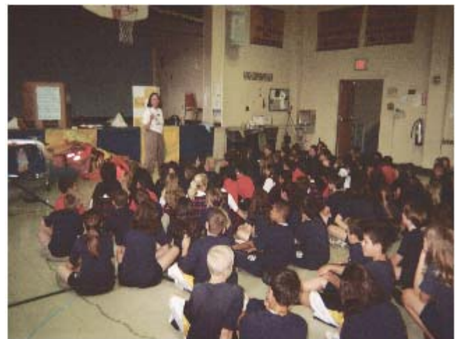
Future Power Squadron Members!