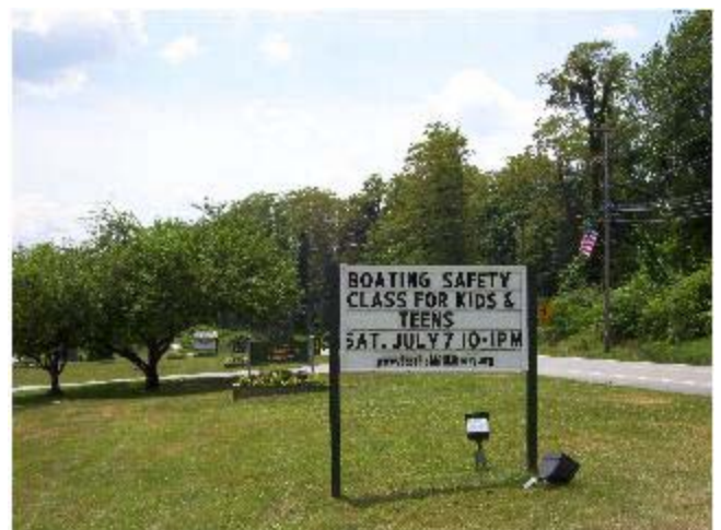
The "Pitch on the Lawn" at East Fishkill