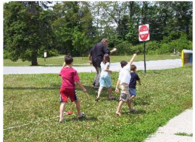
Doing the 50-50-50-50 at East Fishkill