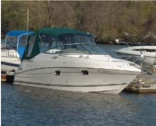
2004 FOUR WINNS 248 VISTA 24 Ft 26'2" LOA 8'6" BEAM EXELENT CONDITION 130 Hours

26'6" WITH SWIM PLATFORM - 8'6" BEAM - 5.0 VOLVO PENTA OSI/X DUO PROP SS COMPOSIT OUTOUTDRIVE - WINDLESS - COCK PIT COVER & FULL CAMPER COVER - VHF - LORAN 68M COLOR GPS MAP/FISH FINDER - AM/FM/CD WITH REMOTE ON SWIM PLATFORM - STOVE - AC/DC REFRIGERATOR -BBQ GRILL - HEAD - SLEEPS 4 - 2004 FOUR WINNS CUSTOM TRAILER W/SURGE BRAKES.