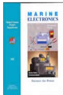
Coming Soon on Friday's.