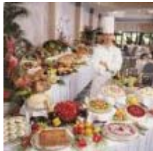
All this food, and so little time!

Uniform: A or F or G or Appropriate Attire