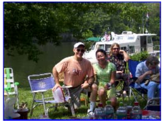
Relaxing in the Sun