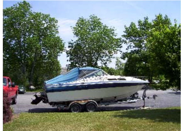
1989 Celebrity 224SE 350 Chevy Engine... 260 HP 22.4ft Cuddy Cabin... fully equipped Low Hours.... 1990 easy load trailer Purchased new...June 1989

CONTACT ANDY 845-876-0761 or agizmo@fish@yahoo.com $45000 or Best Offer