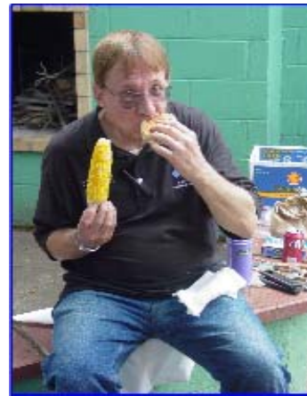
Don't see this very often!