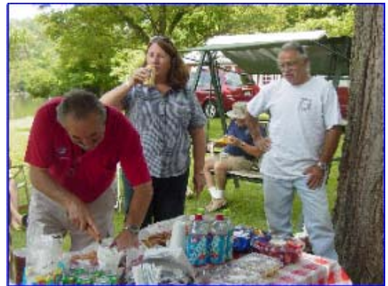
Plenty of Chow