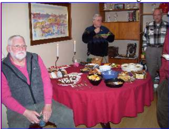
All These Treats, and So Little Time!