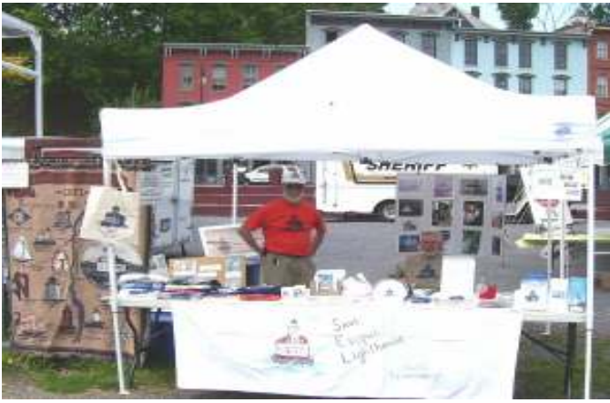
Save the Lighthouse