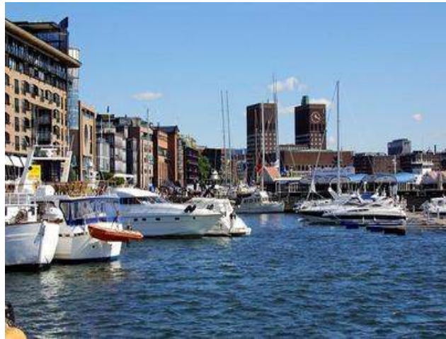
Price of Gasoline on 22 March 2008

Opening Day 17 June 2008 at Dutchess Stadium at 1905 vs. Aberdeen Ironbirds.