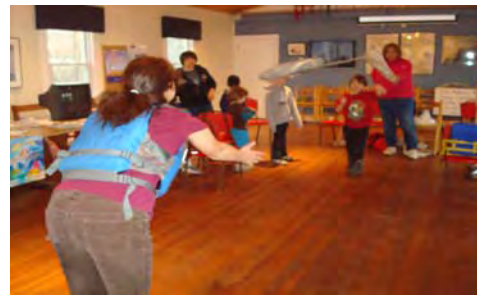
Throw the safety line & buoy