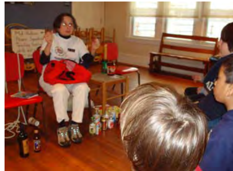
This is your life vest