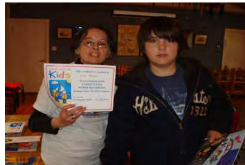
Here the certificate

Visit our website for the "Picture Gallery" www.midhudsonpowersquadron.com/