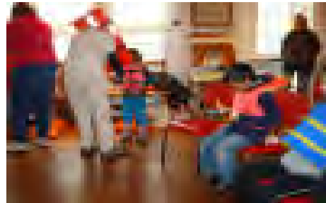
How to put your vest on